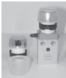
BA 221 SSK